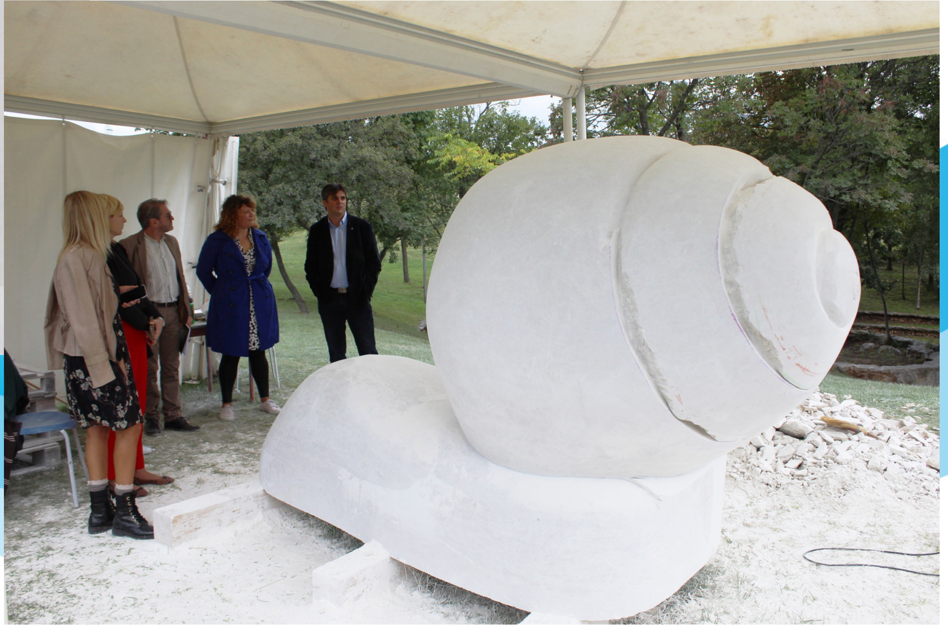
Carving snail in process.